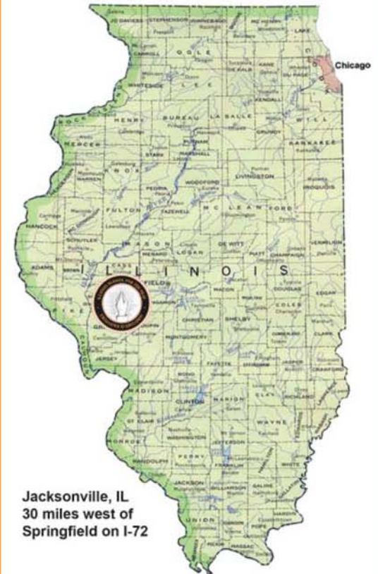
Jacksonville, IL 30 miles west of Springfield on I-72